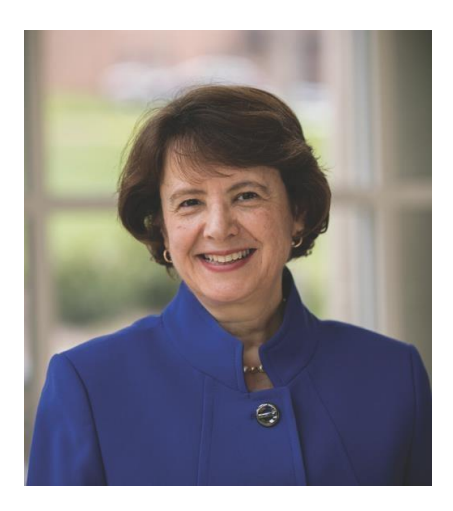
To the Notre Dame Community –

Notre Dame of Maryland University is a community in its truest sense and together we are committed to the safety and security of all members of our University. It is up to each one of us to help foster a secure and supportive environment here at Notre Dame—an environment where individuals can feel safe to visit, learn, work, and live.