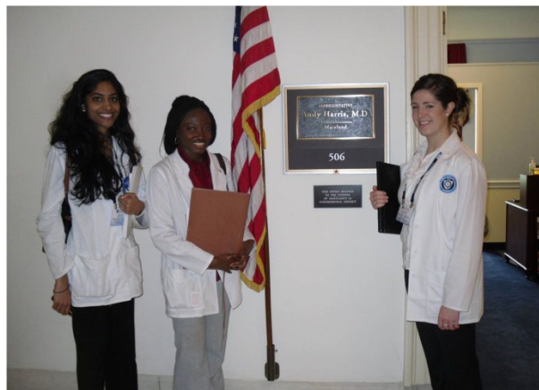
National Association of Chain Drugstores RxImpact Program on Capitol Hill

Note 1: The Admissions Committee will pay special attention to pre-pharmacy math and science coursework that were taken more than five years ago. Science and math coursework that were taken within five years are preferred.