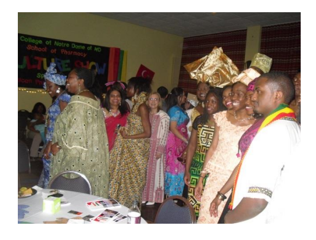
American Pharmacists Association – Academy of Students Multicultural Night