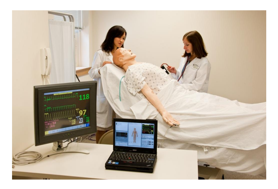
Pharmacy Practice Simulation Lab

All correspondence from University offices is sent to the student's priority address on file in the Registrar's office. Any change to this address should be reported to the Registrar's office as soon as possible. Failure to keep this address up to date may result in delays in receiving important information. It is the student's responsibility to provide the University with correct address information.