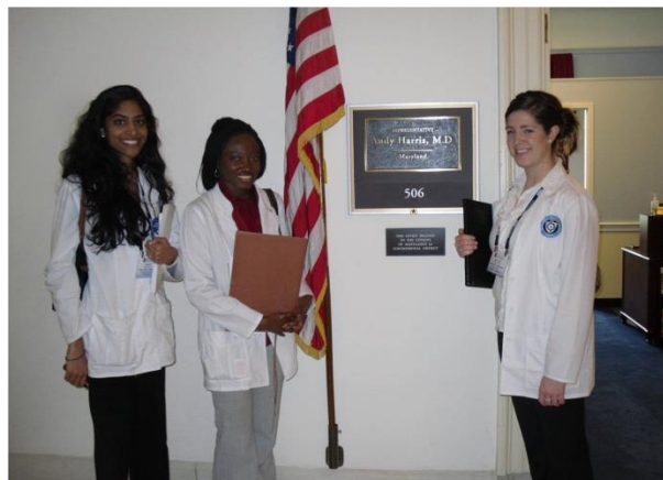
National Association of Chain Drugstores RxImpact Program on Capitol Hill

Note 1: The Admissions Committee will pay special attention to pre-pharmacy math and science coursework that were taken more than five years ago. Science and math coursework that were taken within five years are preferred.