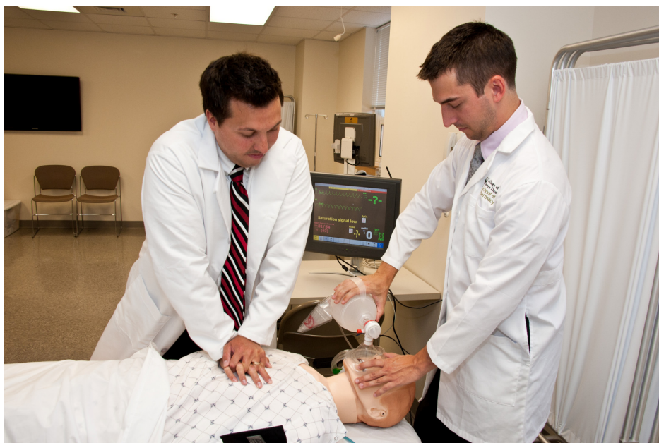
Pharmacy Practice Simulation Lab