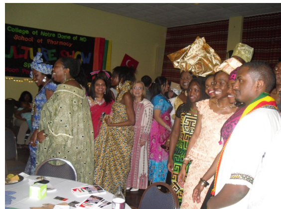
APhA-ASP Multicultural Night