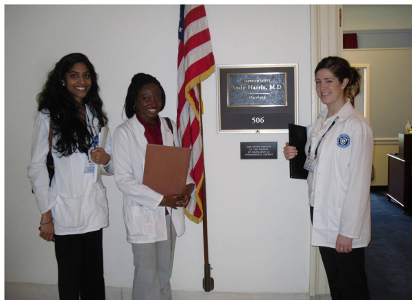
National Association of Chain Drugstores RxImpact Program on Capitol Hill

Note 1: The Admissions Committee will pay special attention to pre-pharmacy math and science coursework that were taken more than five years ago. Science and math coursework that were taken within five years are preferred.