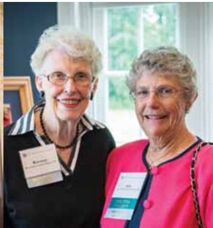
100 St. Albans Society launched with Preview of the President's Residence.