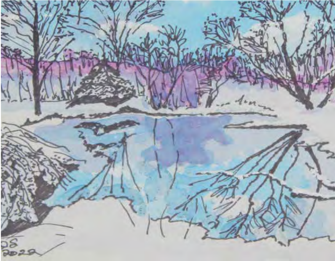
Old Woman Pond, Ink and Watercolor, Deborah Slawson