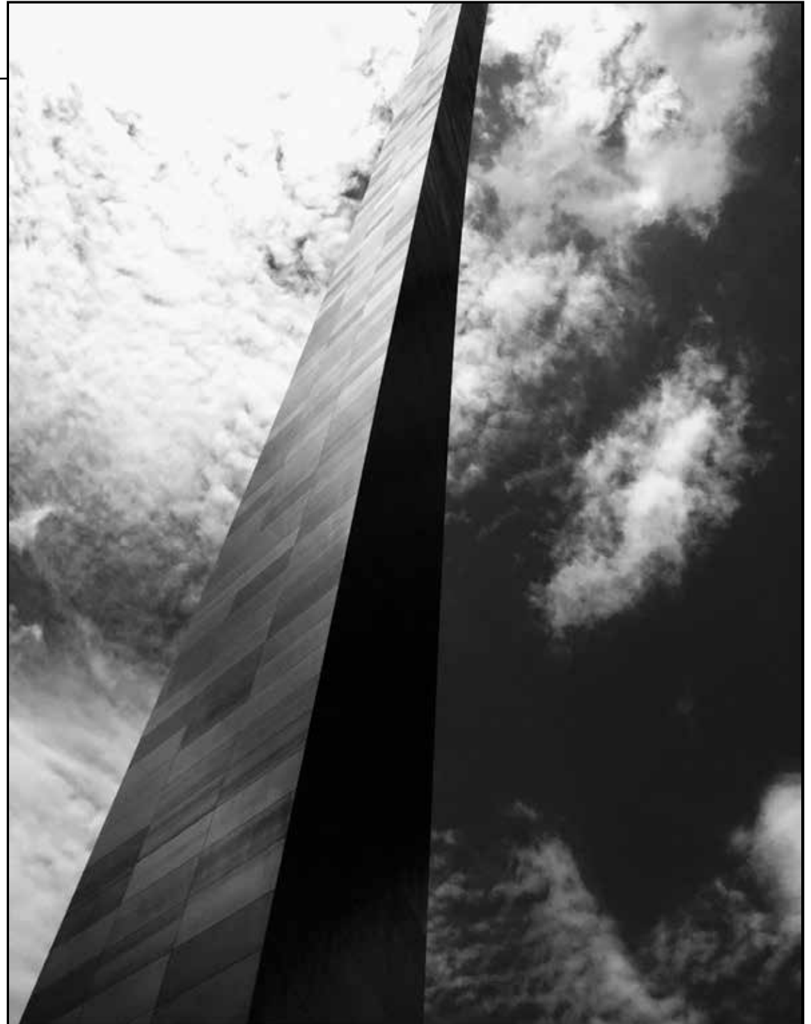
Arch