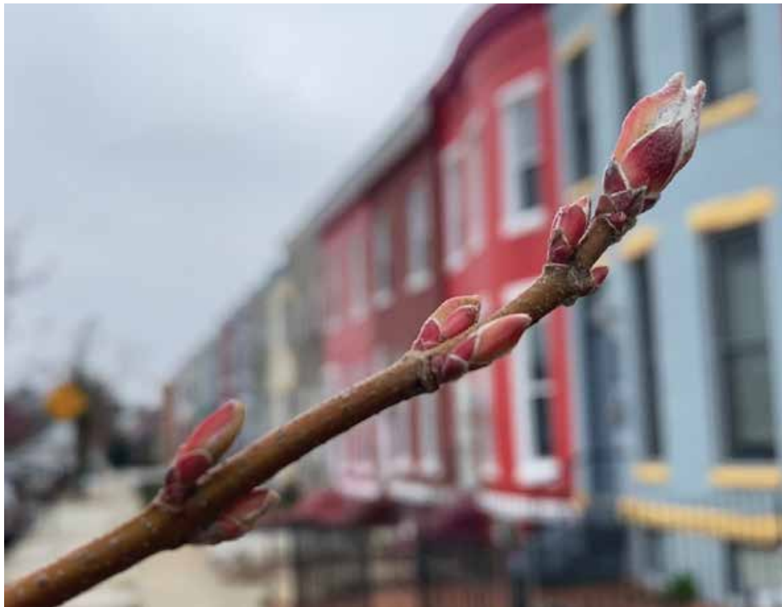
City Springing, Photo, Jen Swartout

snowcap melts on red holly berries spring baptism