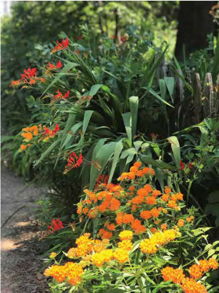
Summer Pollinator Garden

If you are interested in natural history, you will find much to learn in his books (possibly you already know some of them). If you are not interested in natural history, E.O. Wilson might change your mind.