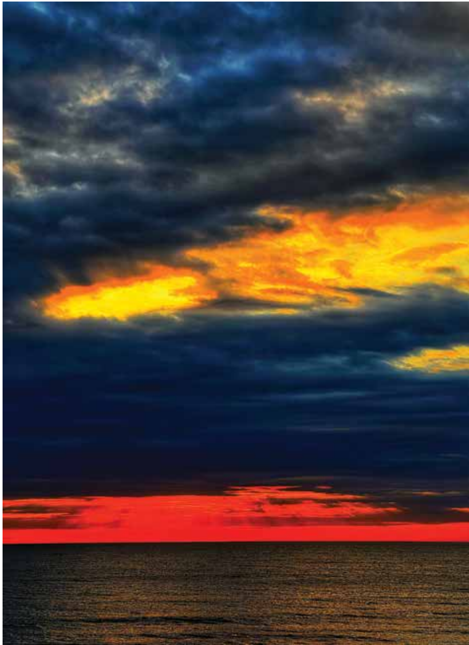
Aweigh