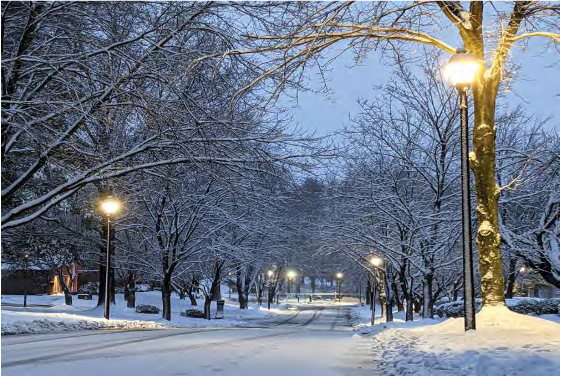
Snowy Way, Photo, Howard Saltzman