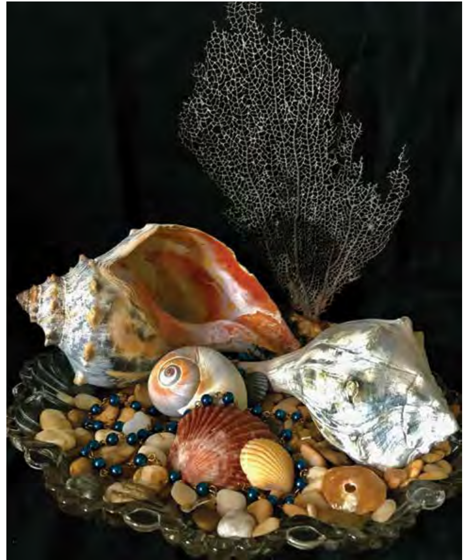
Sea Still Life

I answer, “Grandpop, I am so sorry not to have known you. But every time I open the box, I know you're with me.”