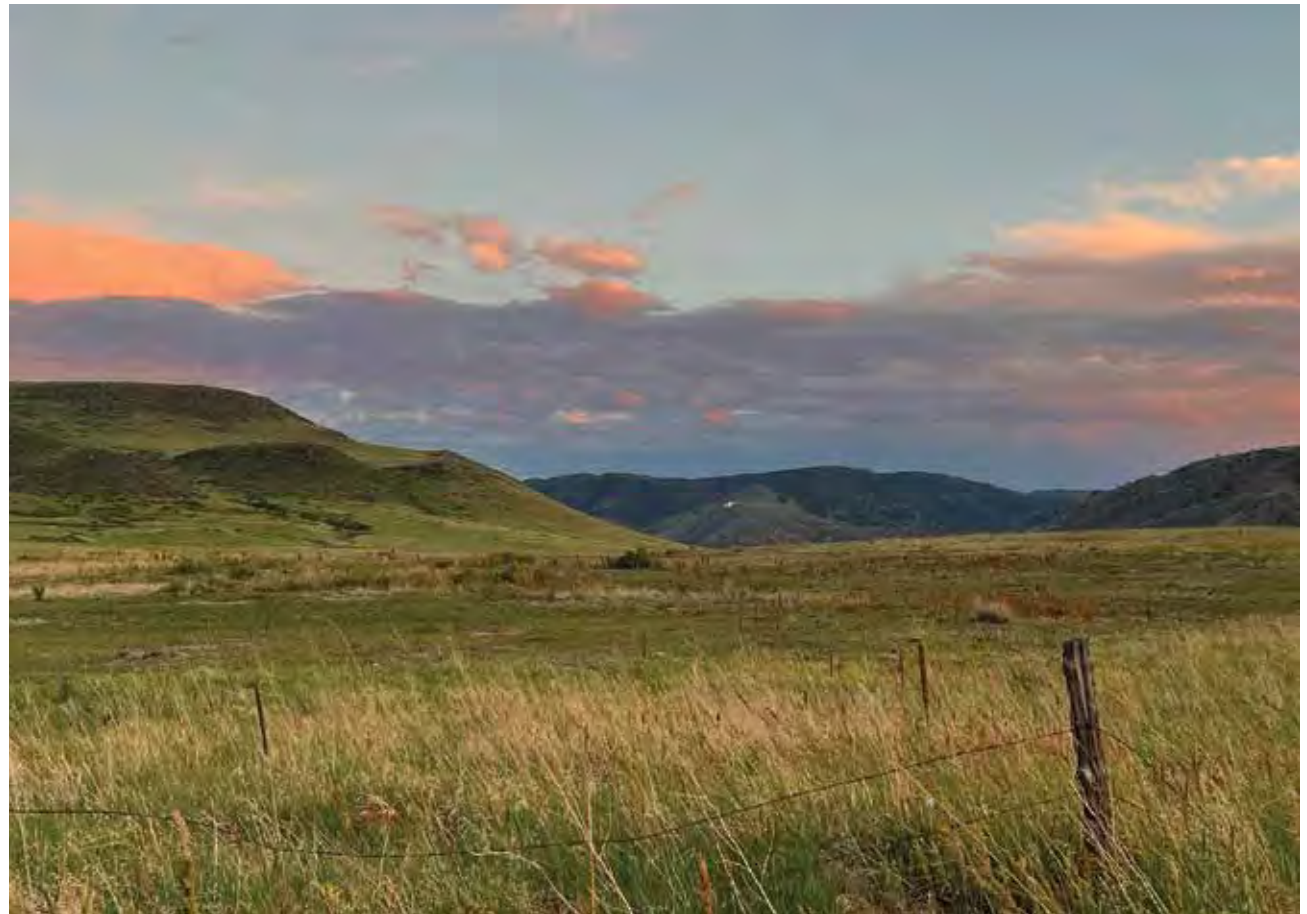
Golden Prairie