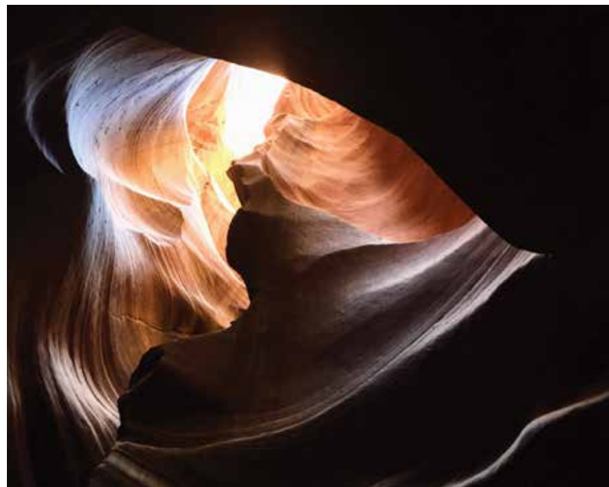
Heart Rock

An eerie silence took hold of the scene. The old engraver stood on the curb nearby, nodding. With the fourth space in the family plot now accounted for, his work was complete.