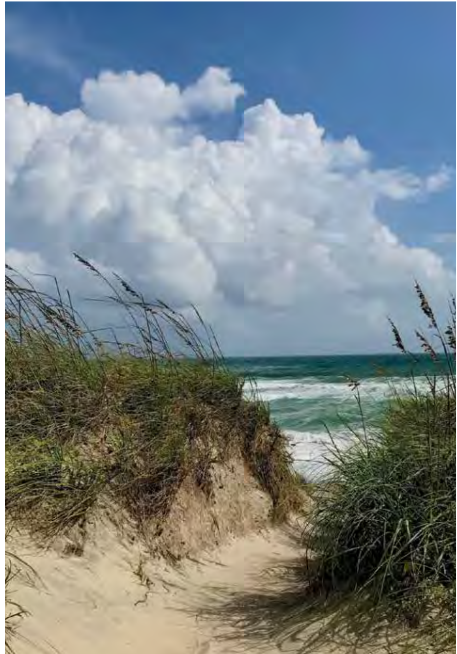
Path to Happiness, Photo, Armand Pulcinella