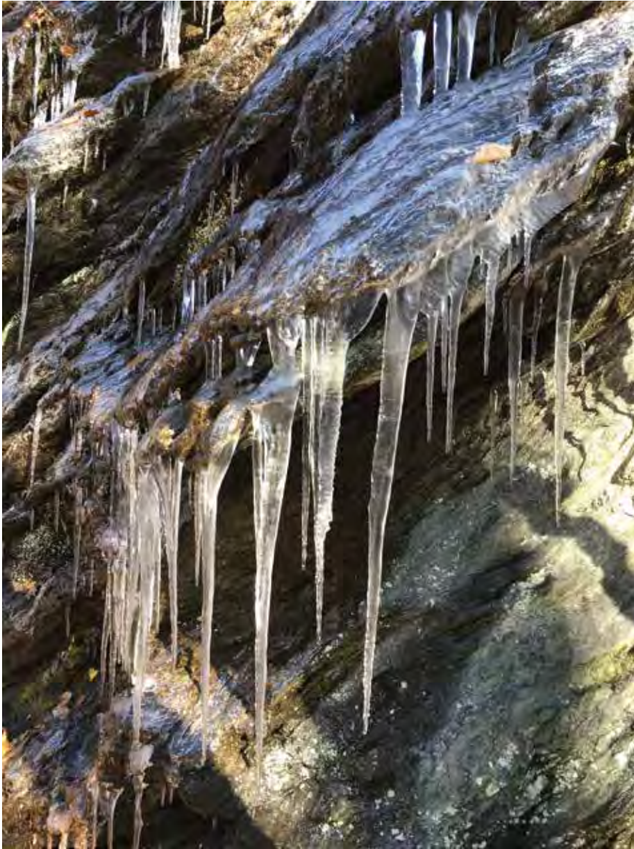
Winter Beauty, Photo, Ginny Lipscomb