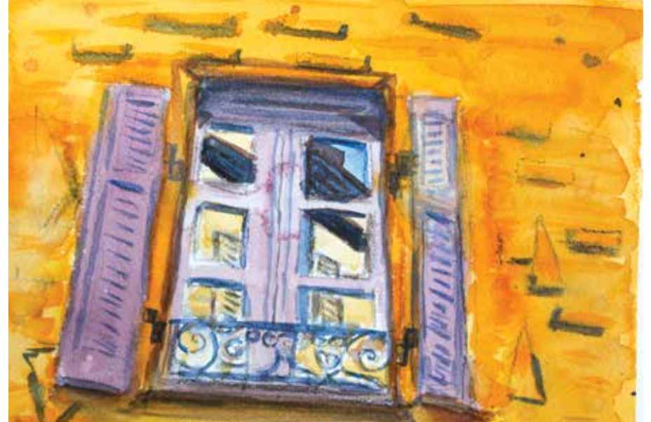
Window, Watercolor, Robin Ujeic-Snyder