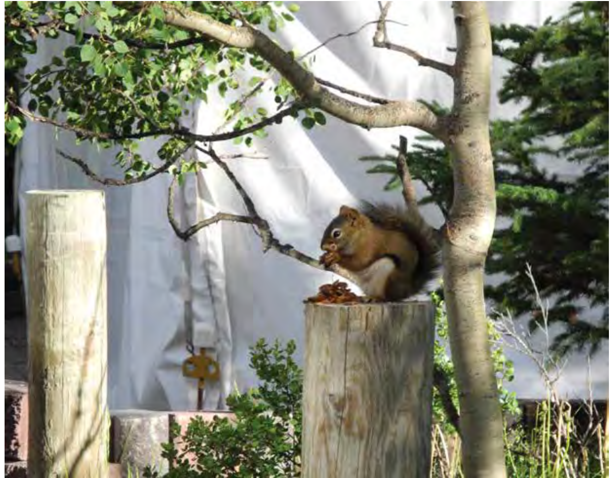
Official Greeter at Portmeirion Village, Wales