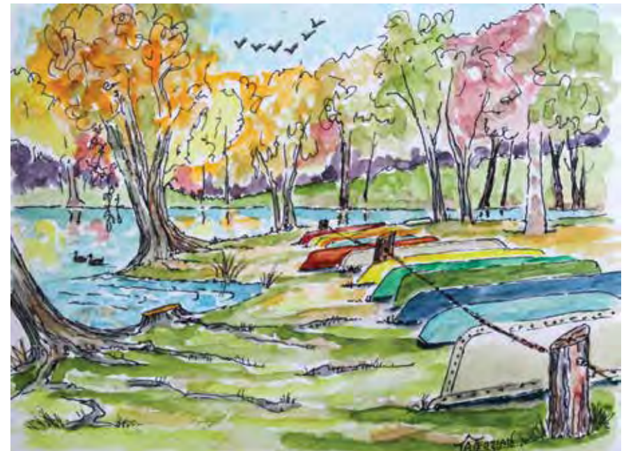
Loch Raven Boats, Plein Air Watercolor with Ink, Sarah Tateosian