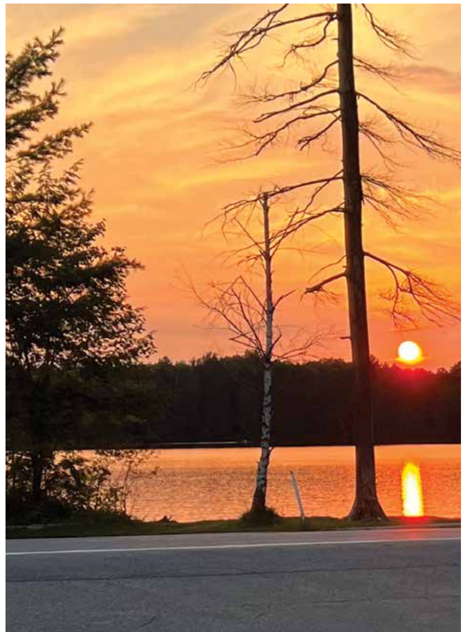
Sunset on the Lake