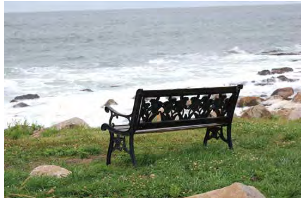
Bass Rocks (top), Seaside Reflections (bottom), Photos, Laurie Rosenberg