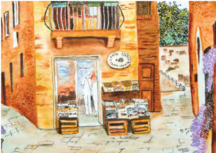
Fruit Vendor, Watercolor

Our little group takes the train to Times Square, the shuttle to the West Side, and the 7th Avenue local one stop to 34th Street. Penn Station is crowded, and I am excited to see many soldiers, sailors and Marines in their splendid uniforms. Suddenly, I am lost in a forest of legs, and I can't locate my father. Then I see him in front of me. I grab his coat and a strange man turns around to look at me. To this day, I can recall that moment of panic. But my father is actually right behind me, and he takes my hand. I am flooded with relief.