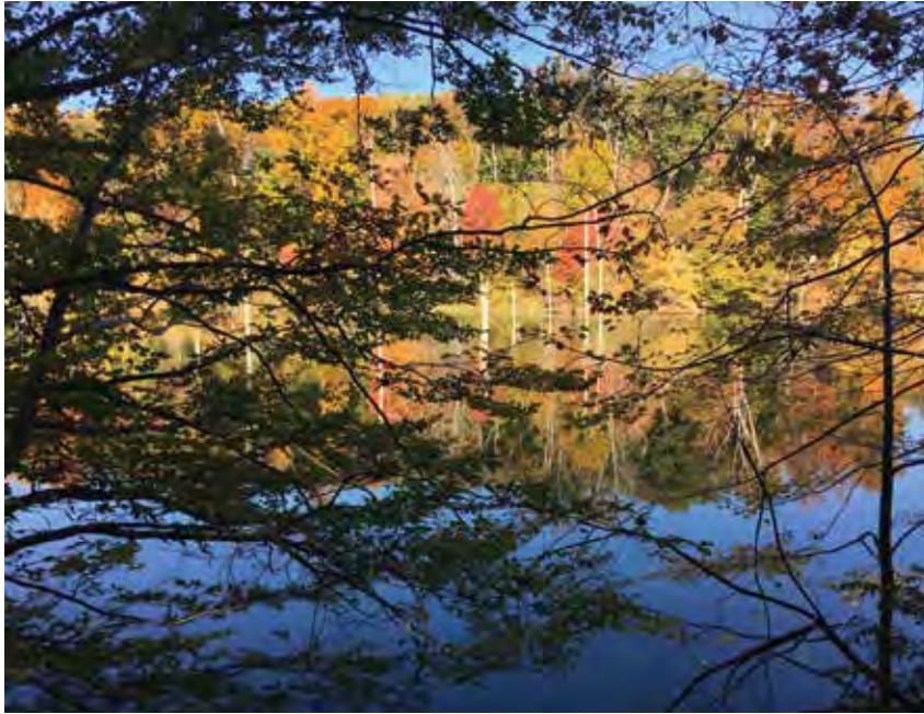
Black Hill Regional Park